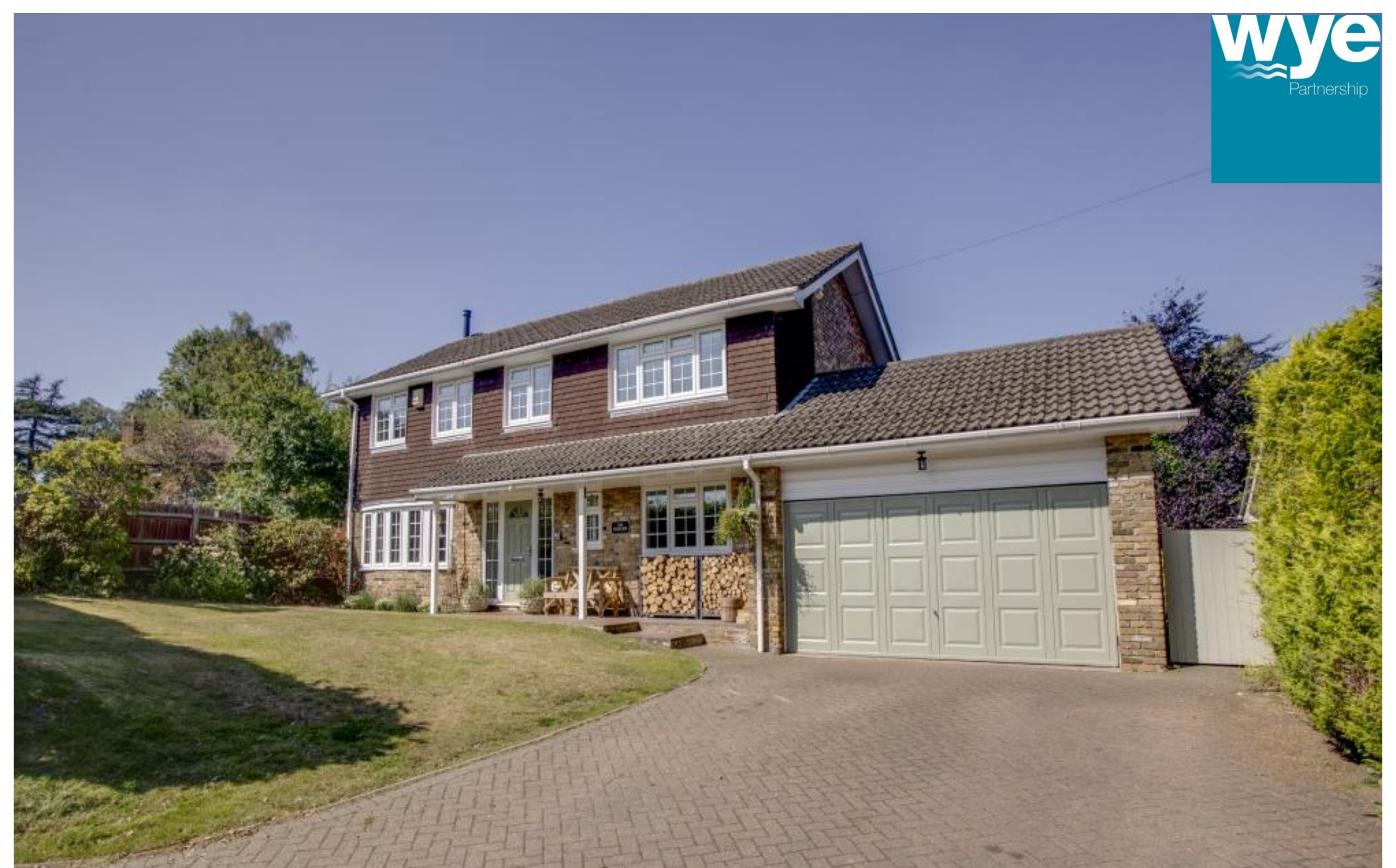
The Hollies Hare Lane Little Kingshill Buckinghamshire HP16 0EF